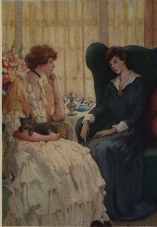
SHE PUT ALEXANDRIA INTO THE MOST COMFORTABLE OF HER CHAIRS AND DREW ANOTHER CLOSE TO IT